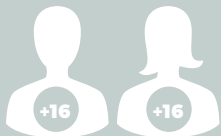
ADULT PATIENTS (OVER-16S)