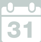
EMERGENCY CARE ROUND THE CLOCK, EVERY DAY OF THE YEAR